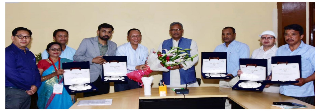
उत्तराखंड को स्वच्छ भारत मिशन ग्रामीण के तहत 07 राष्ट्रीय पुरस्कार मिलने पर उत्तराखंड की ओर से सम्मानित होने वाले प्रतिनिधियों ने मुख्यमंत्री श्री त्रिवेन्द्र सिंह रावत से भेंट की। दिनांक : 07 सितम्बर, 2019

Hon'ble Chief Minister of the state congratulated the awardees for bagging 7 Swachh awards for the state.