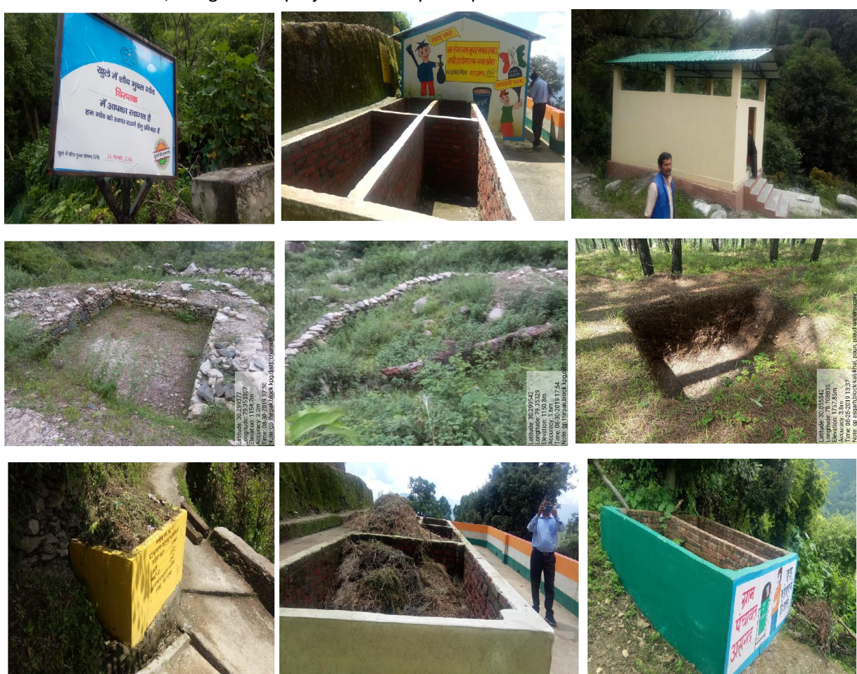
जनपद चमोली की ग्राम पंचायत थिरपाक एवं असगढ़ में ठोस एवं तरल अपशिष्ट प्रबन्धन एवं जल सरंक्षण —संवर्धन सम्बन्धी गतिविधियाँ

iii. State level Team of Swajal visited the GP Asgarh of district Pauri and GP Tirpak & Uladi of district Chamoli to review the Solid & Liquid Waste Management activities under SBM(G) and water conservation activities under NRDWP (Flexi Fund). A general meeting was also conducted in which UWSSC members, villagers and project officials participated.