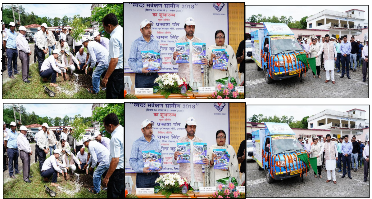
and necessary instructions have been issued from PMU, Swajal to all DPMUs to cooperate and provide necessary information to the officials of Kantar IMRB.

• The Ministry of Drinking Water and Sanitation, Govt. of India has launched the Swachh Survekshan Grameen 2018 (SSG 2018). Under this, ranking of all districts and states will be done on the basis of quantitative and qualitative sanitation (Swachhata) parameters. The top performing states and districts are expected to be awarded on 2<sup>nd</sup> October 2018. In the process, communication