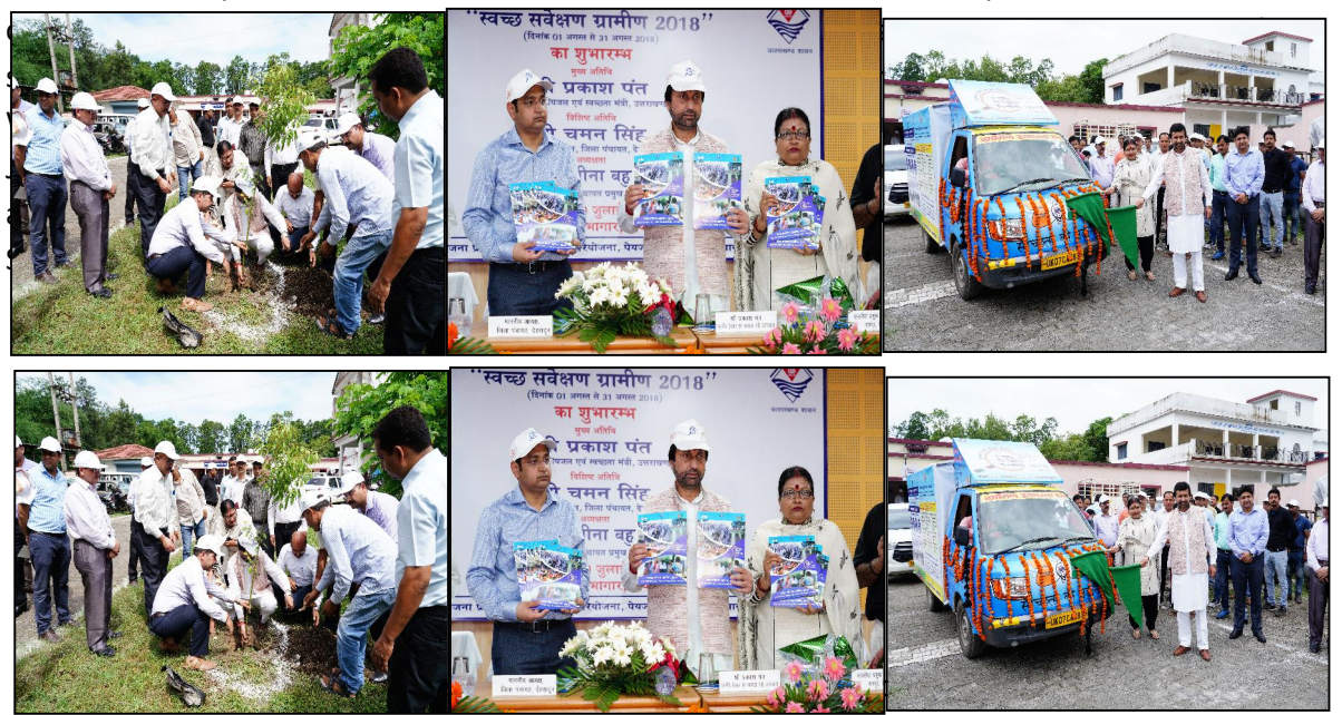
and necessary instructions have been issued from PMU, Swajal to all DPMUs to cooperate and provide necessary information to the officials of Kantar IMRB.

• The Ministry of Drinking Water and Sanitation, Govt. of India has launched the Swachh Survekshan Grameen 2018 (SSG 2018). Under this, ranking of all districts and states will be done on the basis of quantitative and qualitative sanitation (Swachhata) parameters. The top performing states and districts are expected to be awarded on 2<sup>nd</sup> October 2018. In the process, communication