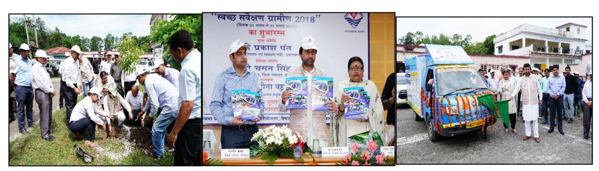
and necessary instructions have been issued from PMU, Swajal to all DPMUs to cooperate and provide necessary information to the officials of Kantar IMRB.

• The Ministry of Drinking Water and Sanitation, Govt. of India has launched the Swachh Survekshan Grameen 2018 (SSG 2018). Under this, ranking of all districts and states will be done on the basis of quantitative and qualitative sanitation (Swachhata) parameters. The top performing states and districts are expected to be awarded on 2<sup>nd</sup> October 2018. In the process, communication campaign will be carried out and rural communities will be engaged in the improvement of the sanitation and cleanliness of their surrounding areas. In Uttarakhand state, Minister for Drinking Water & Sanitation, Uttarakhand state has launched Swachh Survekshan Grameen 2018 on 29<sup>th</sup> July 2018 at Block Office, Raipur, Dehradun. He also planted a plant in the premises of Block Office and inaugurated Swachh Survekshan Grameen 2018 guideline/Booklet. He also launched a Swachhta Rath for IEC of this campaign.