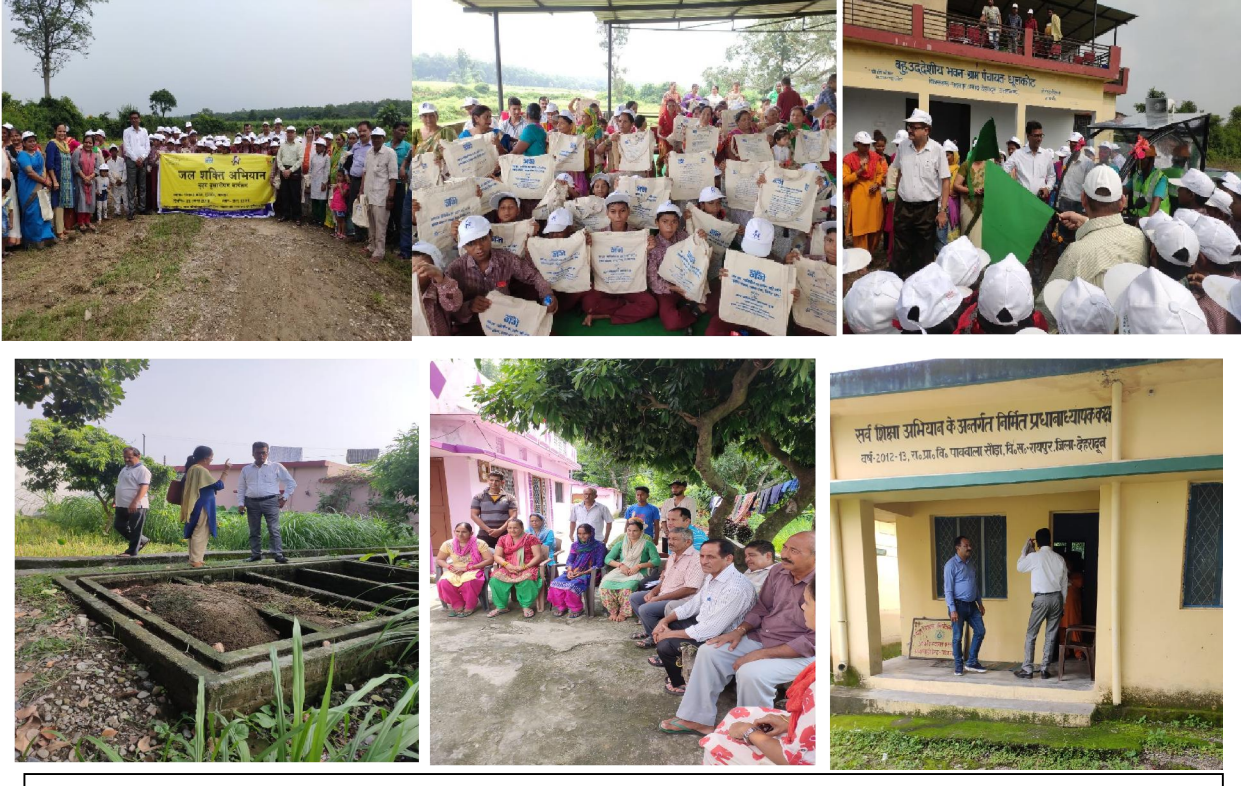
Reviewing SLWM activities in GP Pavwala Sauda (Block Raipur)

v. State level Team of Swajal visited the GP Asgarh of district Pauri and GP Tirpak & Uladi of district Chamoli to review the Solid & Liquid Waste Management activities under SBM(G) and water conservation activities under NRDWP (Flexi Fund). A general meeting was also conducted in which UWSSC members, villagers and project officials participated.