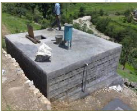
CWR & chlorinator of a W/S scheme