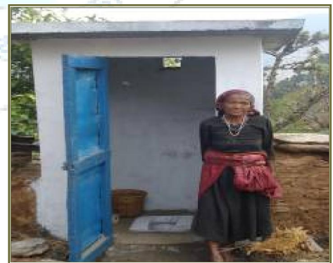
IHHSL toilet constructed in GP- Kharani of Betalghat Block