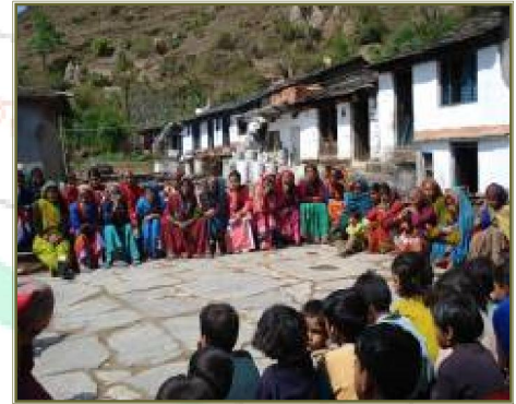
ATD meeting UWSSC-Bamansari GP-kherda