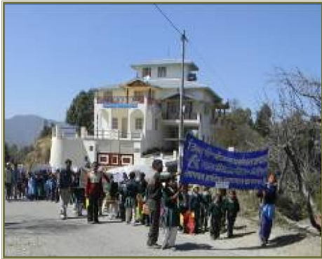
Students Rally for awareness generation regarding TSC