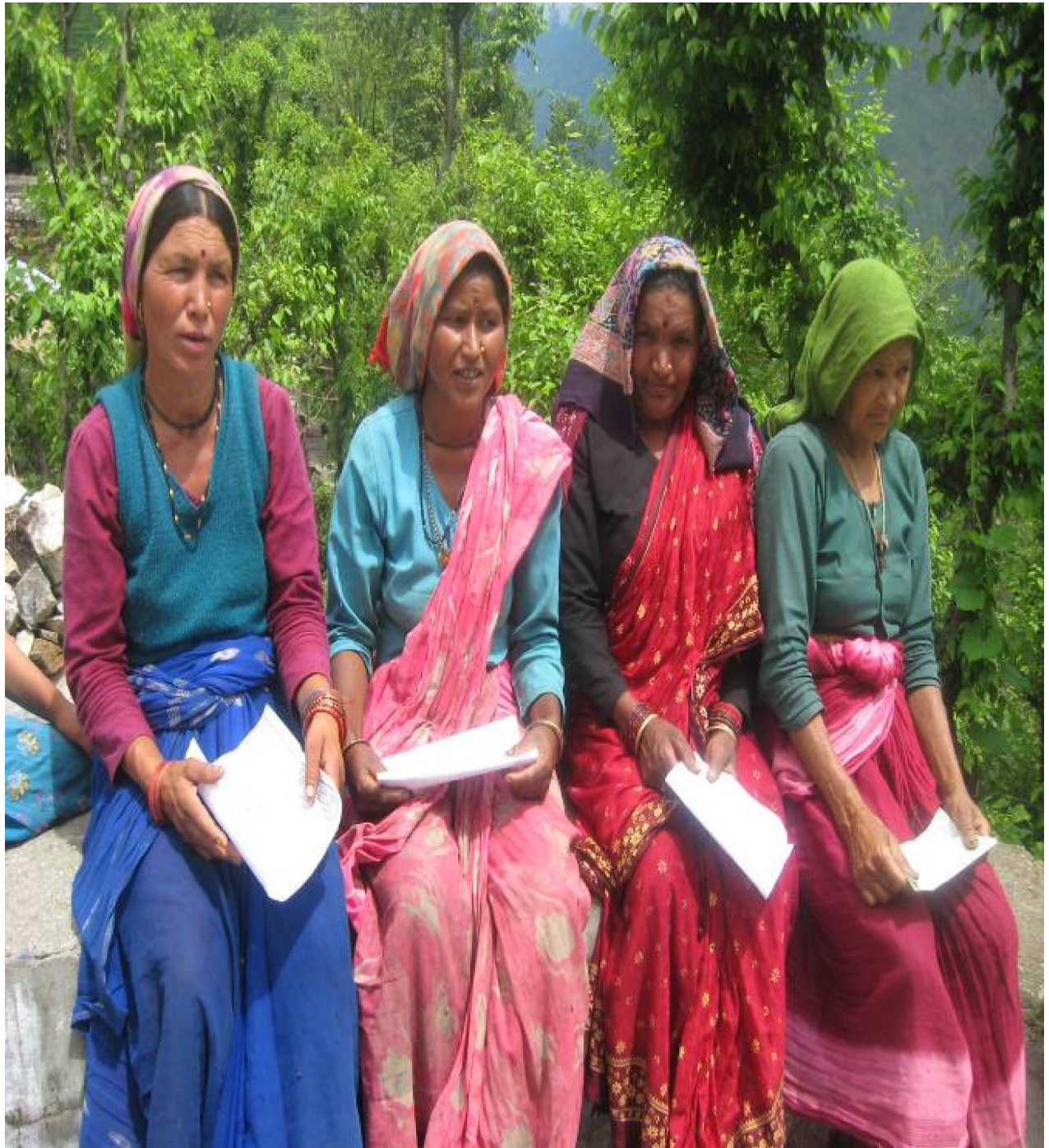
Empowered Women - Empowered Community